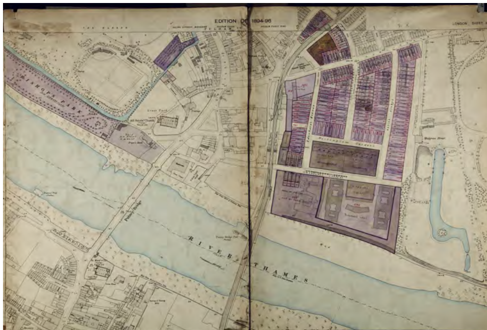
Fulham Estate Map CERC (fragment)

For more background on property holdings, see the Research Guide on Church Property.