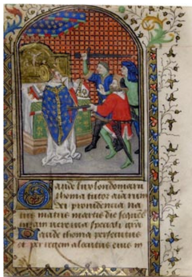
The martyrdom of St. Thomas Becket, from the Tarleton Hours c.1430. Purchased with the aid of the Friends 2003

Manuscript acquisitions have included letters and papers of Archbishops Arundel, Pole, Sancroft, Manners Sutton and Howley, papers relating to the divorce of Henry VIII and Catherine of Aragon, and an important series of documents removed from the study of Archbishop Laud after his arrest and recovered with the help of the Friends more than three hundred years later.